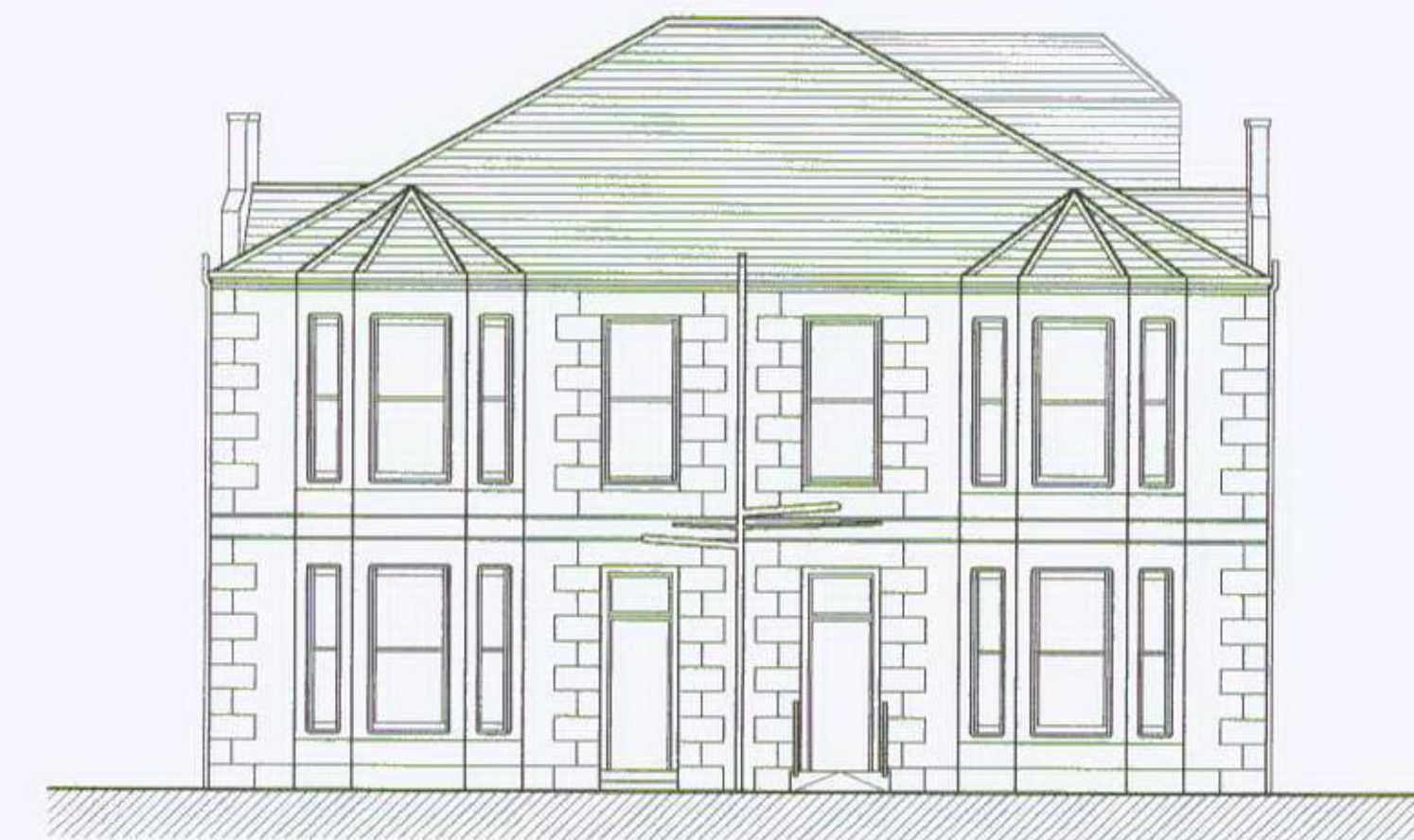
PROPOSED SOUTH ELEVATION (1:100)