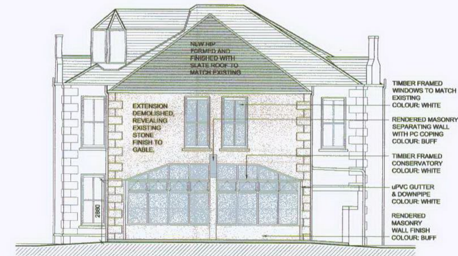
PROPOSED NORTH ELEVATION (1:100)