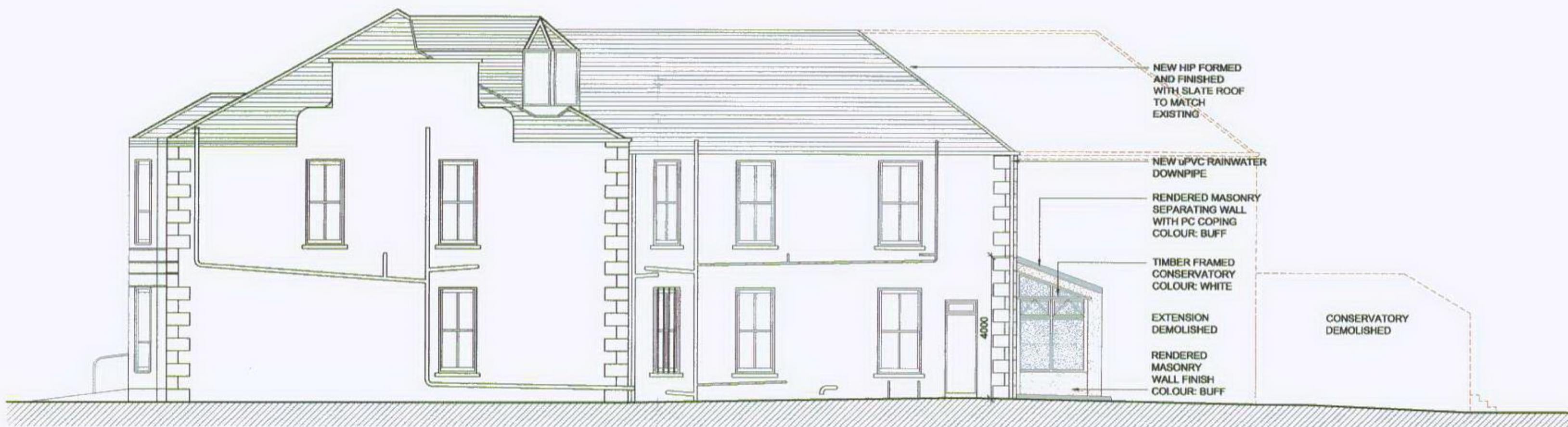
PROPOSED EAST ELEVATION (1:100)