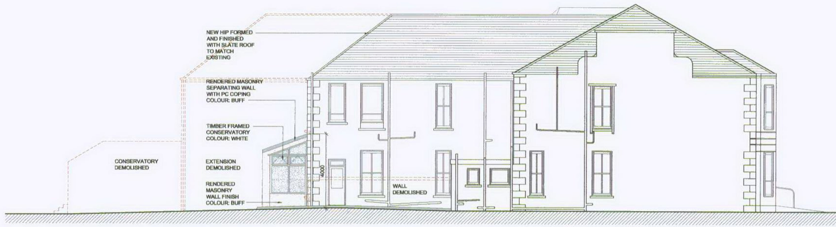
PROPOSED WEST ELEVATION (1:100)