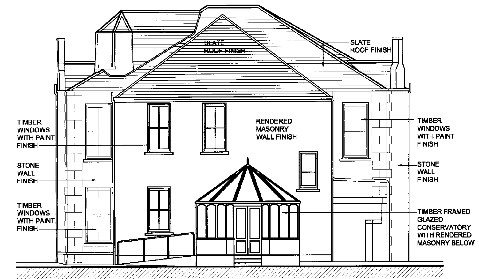
EXISTING NORTH ELEVATION (1:100)