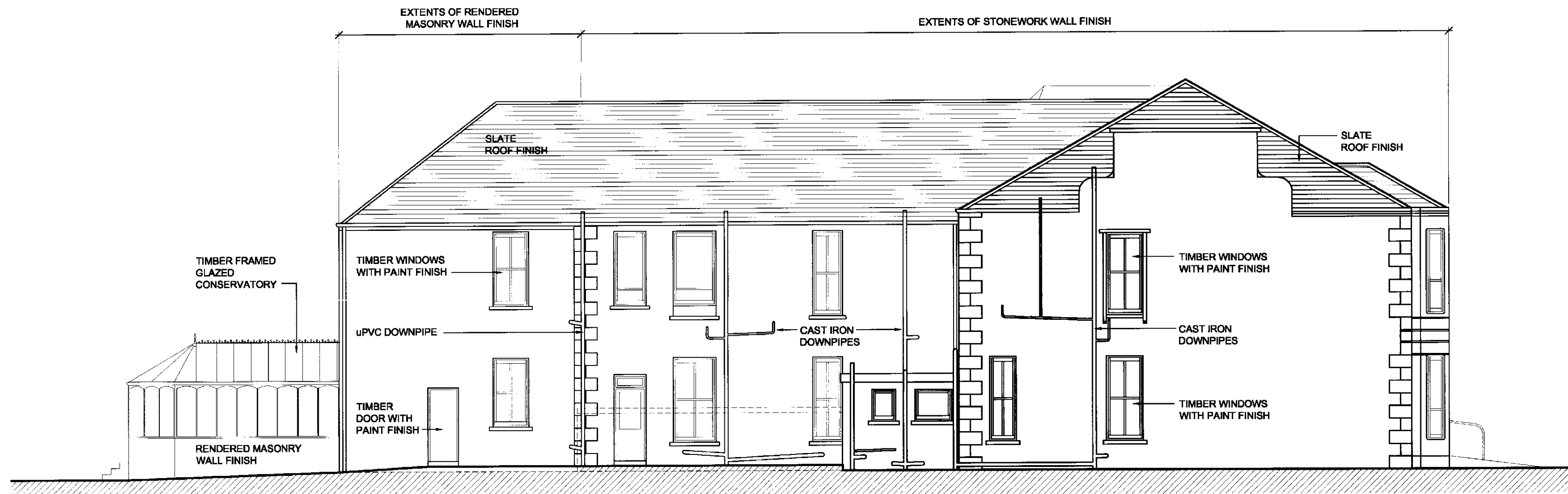
EXISTING WEST ELEVATION (1:100)