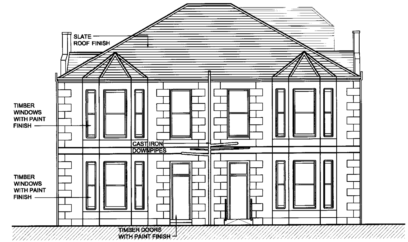
EXISTING SOUTH ELEVATION (1:100)